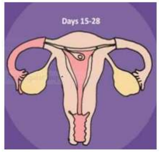
Figure – 4